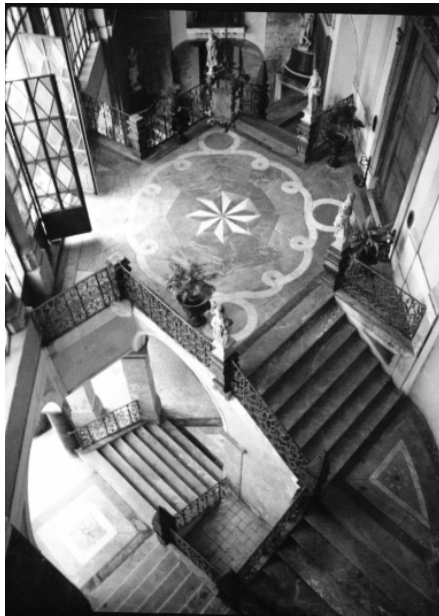
Figure 2: A detail from inside

gives access to the building. Wagner and Rubenstein, to name the most famous, passed through it, the English royal family were guests a few years ago, and it should not be forgotten that this magnificent building was used in the making of Visconti's film 'Il Gattopardo'. The double stairway, judged one of the most beautiful that can still be admired in an eighteenth century mansion, draws attention to the balanced harmony that distinguishes Sicilian Baroque. Entering the lobby, one enjoys the sight of the sober grandeur of the salons: the 'oval' salon original both in shape and the immaculate vivacity of its colours; the 'red' salon full of works of art; the 'light blue' salon, enlivened by the enamels of priceless Chinese and Japanese pieces of art; the ballroom where it is possible to imagine echoes of the 18 th century, delicate musical harmonies and the movements of minuets and gavottes.