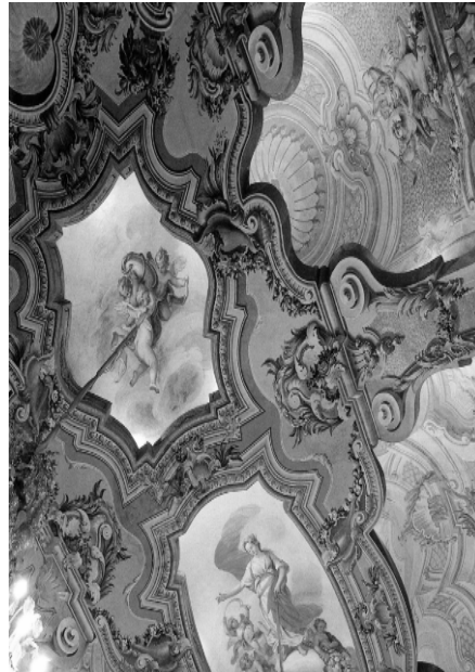
Figure 3: Paintings from inside

However, the room which brings together reality and dreams (fig. 2 and fig. 3), pomp and poetry, is the 'mirror' room, where the magic of the atmosphere created by lights and colours that shimmer in the wide spaces of the ceiling, seems to slide on the surface of the mirrors, confusing shape and line, recreating the atmosphere of a life that has been crystallised in time, enclosed here so that poetry can outlive history.