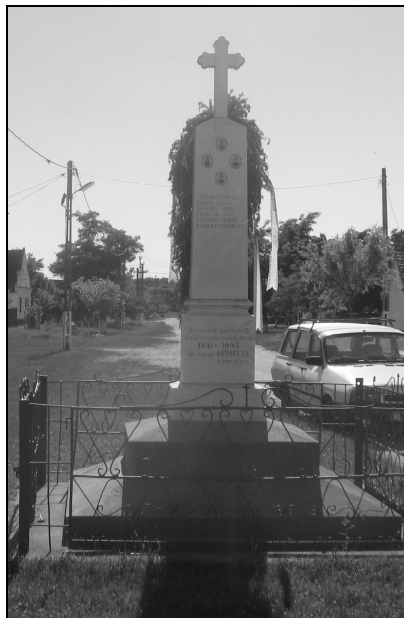
Photo 2: The Heroes' Monument from Berecuta