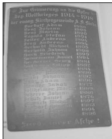
Photo 3: Plaque in Memory of the Germans from Birda who Died in First World War

In the First World War took part about 100 people of which 65 were of German nationality, 24 of them losing their lives either on the Russian battlefield, especially in Galicia, or on the Italian one. In their memory a monument was built with a metal plaque containing all 24 names and data for each (Photo 3). There also Romanians with the ethnic Germans on the battlefield. Some of them have died and others fell prisoners to the Russians or Italians.