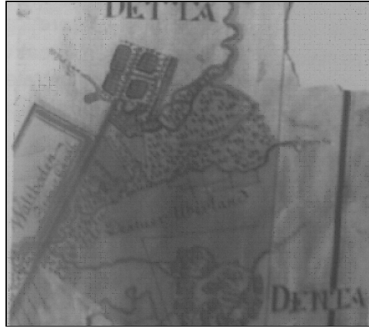
Figure 1: Denta - Map of the commune from the Austro-Hungarian Period

In 1370, Denta is mentioned under the name of Dench as being the property of master Ladislau. Rovinita mare (Omorul Mare) is documentary attested for the first time in 1343, while we had no dates about Rovinita Mica (Omorul Mic) till 1895.