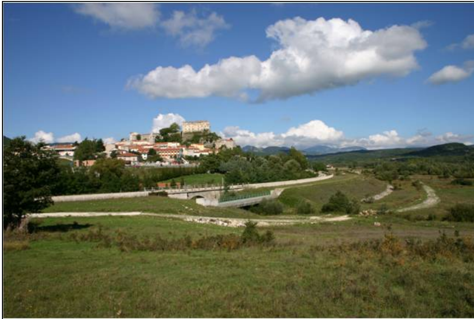
Figure 4: Tratturo Castel di Sangro-Lucera and the hilltop of Pescolanciano with his castle (by G. Di Rocco)

Of all the places mentioned there is also 'one public road leading to Puglia', certainly a 'tratturo'. The territory of Carovilli was, and still is crossed by two major 'tratturi': the localization of some toponyms mentioned in the documents allow determining the 'public road' as the 'tratturo' Celano-Foggia. Indeed, there is at Monte Pizzi (1313 m above sea level) overlooking the valley of Trigno and is located north-west of Carovilli and north of the 'tratturo' Celano-Foggia; also the Stafele, now Staffoli, is located north of Carovilli; the toponym San Leucio remains just north of Celano-Foggia, at Colle Taverna, contiguous to that 'tratturo'; this church is mentioned by Sella for a tithe paid to the diocese of Trivento for the year 1309: Ecclesia de S. Leuci Piczis 25 . We can confirm that, in the first half of the 14 th century, there was a public road going through high Sannio up to Puglia; this way reused part of one of the ancient transhumance routes.