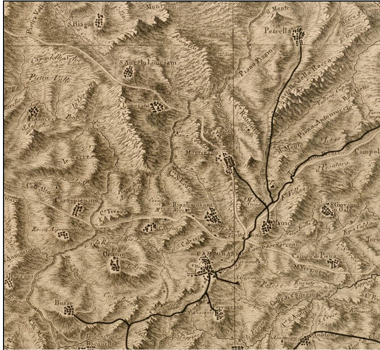
Figure 6: G. A. Rizzi Zannoni, Atlante Geografico del Regno di Napoli , 1808, extract.