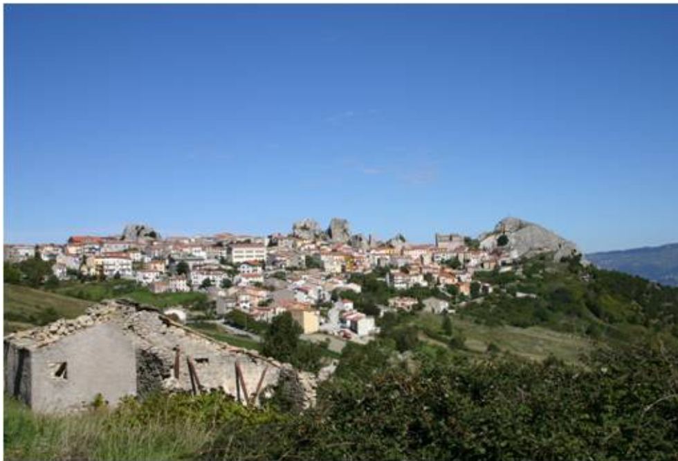
Figure 5: Pietrabbondante: the rock and the modern village

For the orography of the territory of Molise and the topographic, it is therefore clear that distribution of fortified settlements, the protohistoric 'tratturi' have continued to