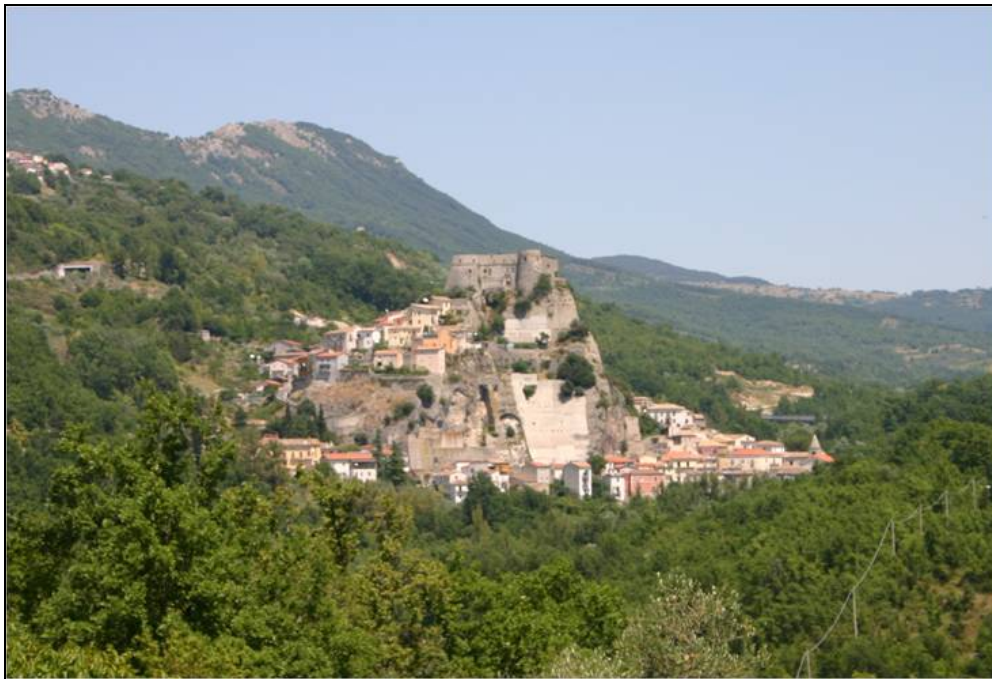
Figure 2: Cerro al Volturno: one of the fortified settlements of the S. Vincenzo Abbey

About the western sector of the Norman County of Molise, as illustrated in previous contributions, from the analysis of the cartularies of San Vincenzo al Volturno, of Monte Cassino and Santa Sofia in Benevento can be deduced for the pre-Norman period a form of sparse fortification of the territory, the most in the upper valley of the Volturno, where a small number of castles were identified dating to the second half of the tenth century. Therefore the presence of the Benedictine monastery has affected the development of feudalism in Molise until the arrival of the Normans. The constant work of repopulation conducted by the monks marks a turning point in promoting the process of fortification in a region characterized, by the abandonment following the Saracen invasions and also from small rural settlements sometimes centralized, of which still it is known too little to draw up a balance.