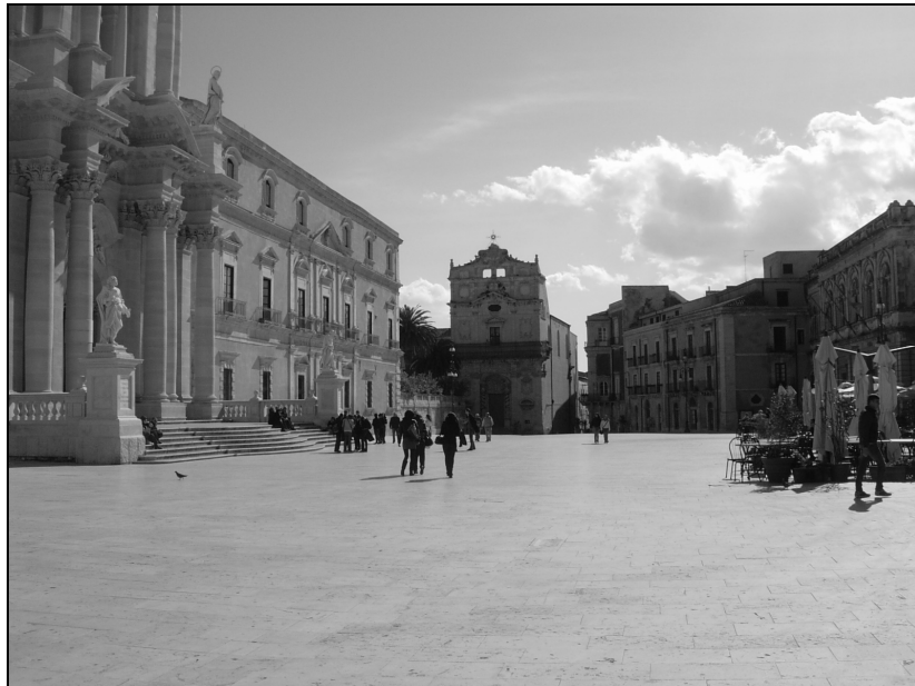
Photo 2: Piazza Duomo's square in Ortigia.

Life in Ortigia is back and resonates in the streets, in bars, in craft shops, in night clubs, in bathing beaches and in the restoration of historic buildings. A new light shines in the Piazza Duomo square, which is called the living room's baroque and has become the symbol of the architectural renaissance since the devastating earthquake of 1693. This square is unique in the world since Syracuse's Baroque does not follow the universal canons of the XVII century, but it is the result of the mastery of the architects Vermexio, Picherali and Ali and the creativity of many local marble and stone cutters who expressed their skills in the precious facades, in creation of movement, in bevelled corners and bulging balconies .