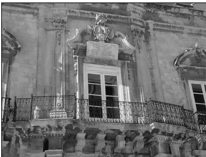
Photo 1: Main balcony: the coat of arms and the plaque commemorating King Ferdinand II of Bourbon's stay at the palace.

The interest in Beneventano del Bosco Palace (photo 1. figure 1) is part of an intensive project for revitalizing the historical and cultural heritage which has recently involved the historical centre of Syracuse, which is the island of Ortigia. Its name, which was assigned due to its particular morphology, comes from the ancient Greek word ortux , "quail", a bird sacred to Athena. On the Ionian Sea, no more than 1 square kilometre in area and rich in rivers it was the first part of the city to be inhabited and the ideal place for different people's settlement: Greeks, Byzantines, Arabs, Normans and Aragons. All Ortigia, in fact, is the legacy of a thousand-year overlap of construction events. It has been object of continuous attention primarily by archaeological research, which has demonstrated an unmistakable dependence of the modern buildings with the Greek installation of archaic age.