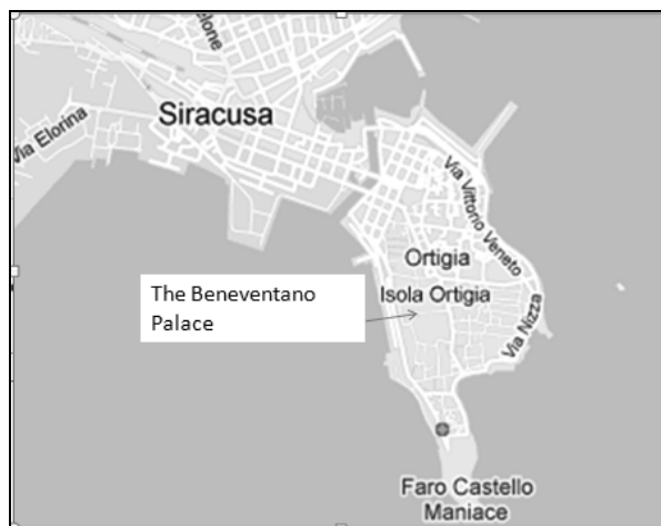
Figure 1: Location of the Beneventano Palace in Ortigia.

Large parts of Ortigia are still clearly a grid based on major roads intercepted at right angles by narrow streets, where rare archaeological monuments stand. Among them it is worth mentioning the oldest Doric temple of the Greek West, i.e. the temple of Apollo, located at the islet's entry, and the temple of Athena, celebrated by Cicero for the refinement and richness of its decoration, beautifully embedded in the structures of the Cathedral. From the eighth century B.C. until today, the city has been developing on this ancient Greek texture. Later, each era has left episodic or striking testimony in relation to the historical events experienced by the city. The traces of the Christian Era are limited to just very few religious buildings such as the church of St. Peter the Apostle. Very little is known of the urban transformations dating back to the Byzantine Era. After the disastrous conquest