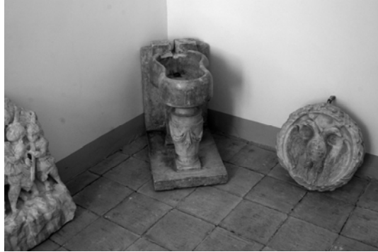
Photo 9: Bidet, the only survivor of the original interior design