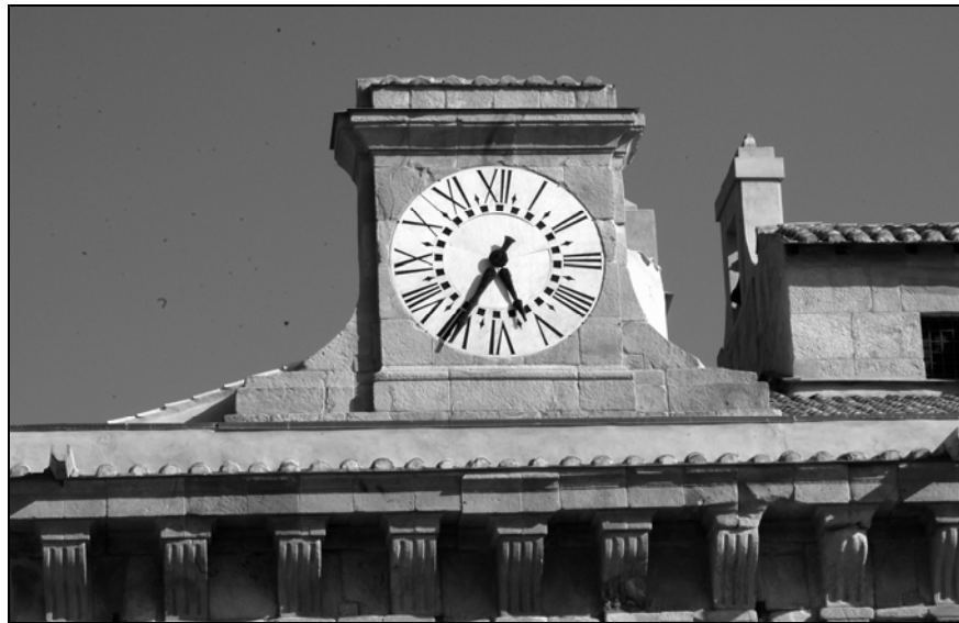
Photo 5: One of the two clocks in the main facade

The façade has two rows of windows separated by a simple cornice. The upper part is crowned by an overhanging cornice supported by sandstone brackets decorated with triglyphs. In the centre of the cornice there is an imposing sandstone sculptural group featuring the Bourbon coat of arms (see photo 4), surrounded by garlands of flowers and surmounted by a crown. The work was carried out by Giosuè Durante, a sculptor from Palermo who worked between the end of the 18 th and the beginning of the 19 th centuries (Morello, 1998). Next to the coat of arms there is a statue of the God Pan, guardian of fields, grazing flocks, hunters and shepherds, while on the right side there is a statue of Diana, sister of Apollo, Goddess of the hunt, woods and vegetation, surrounded by deer and wild animals. In the execution of the work Giosuè Durante was assisted by Francesco Quattrocchi, a descendant of the numerous Palermo dynasty of prestigious stonemasons. Finally, on top of the cornice at the two extremities of the façade there are two clocks which were made by Giuseppe Lorrìto and sons, as testified by the engraving that can still be partly read on one of them (photo 5).