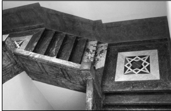
Photo 6: The red marble stairway leads up to the noble floor