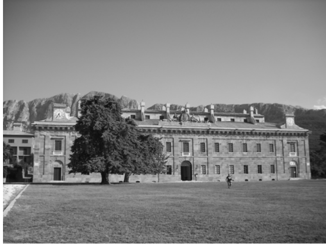
Photo 1: A general view of the palace including part of the Bourbon piazza (Ficuzza). Main facade of the Royal Hunting Lodge

The Elymians were indigenous to these sites during the Iron Age. In Roman times, the western part of Rocca Busambra was crossed by a road, the line of which coincides more or less with the present-day main road between Palermo and Corleone. The whole vicinity of Rocca Busambra was a strategic point for controlling the territory and an ideal place to live, safe from external dangers and attacks. On the eastern side of the mountain it was possible to observe what is today the town of Mezzojuso and control the Vicari plain and the main roads leading inland and towards Agrigento. On the highest parts of the area, Pizzo del Re (King's Peak) and Pizzo Castello (Castle Peak), there are the remains of a fortified residential settlement dating from the VI century BC believed to have been built by the Elymians. Moreover, in late Roman times a settlement was reported near the branching Alp, a fortified site mentioned by the Arab geographer Al Idrisi 3 (Tusa S., 2000).