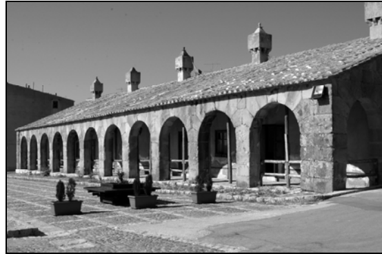
Photo 2: The servants' lodgings and stables. (next to the palace)

admired today despite its present neglected state (photo 2). Thanks to the inventories that have been discovered, we can also understand the complexity and nature of the palace furnishings and what tools and instruments were used in the adjoining buildings (Dispenza, 1987).