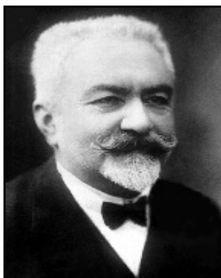
Figure 4: Emil G. Racoviță (1868-1947)

On 26 th April 1920, King Ferdinand enacted the Law regarding the creation of an Institute of Speleology at the University of Cluj , and this action meant that Romanian caving moved from sporadic actions to the systematic ones (Racoviță, 1999).