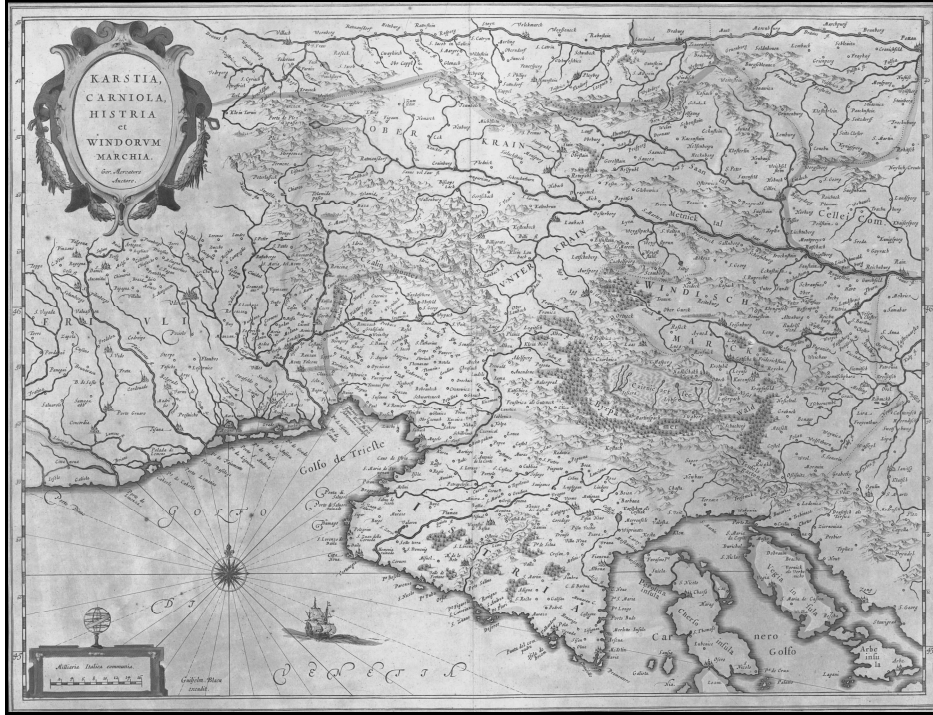
Figure 1: Mercator's Map (Amsterdam, 1585) called "Karstia, Carniola, Histria et Windorum Marchia"