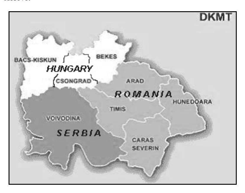
Fig. 2. The countries of DKMT after June 2003 (www.dkmt.hu)

The ineffectiveness of DKMT in the years 1999-2000 was due to the bombing launched by NATO forces to Pančevo, Novi Sad and other economic centers of Vojvodina. During the crises in former Yugoslavia the Romanian and Hungarian support was limited to sheltering the refugees. After the 1999 bombing, Vojvodinian industry was negatively affected by the UN embargo as well. As a matter of fact, the technical equipment in quite a few factories remained largely out of date since the import of new machinery was not possible (Tomic&Romelic, 1997).