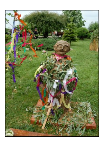
Figure 2. "Caloianul", Greci commune, Tulcea county

beautiful party with songs and and games that last and last until late evening or even the next day (Ghinoiu, 1997). Since the area boasts the most limestone massifs in Europe (especially in the Iasi county), the lime honey takes over from the exceptional qualities of the flowers from which it comes, making it unique in the world by its composition, which brings joy and is celebrated fast by locals of those areas.