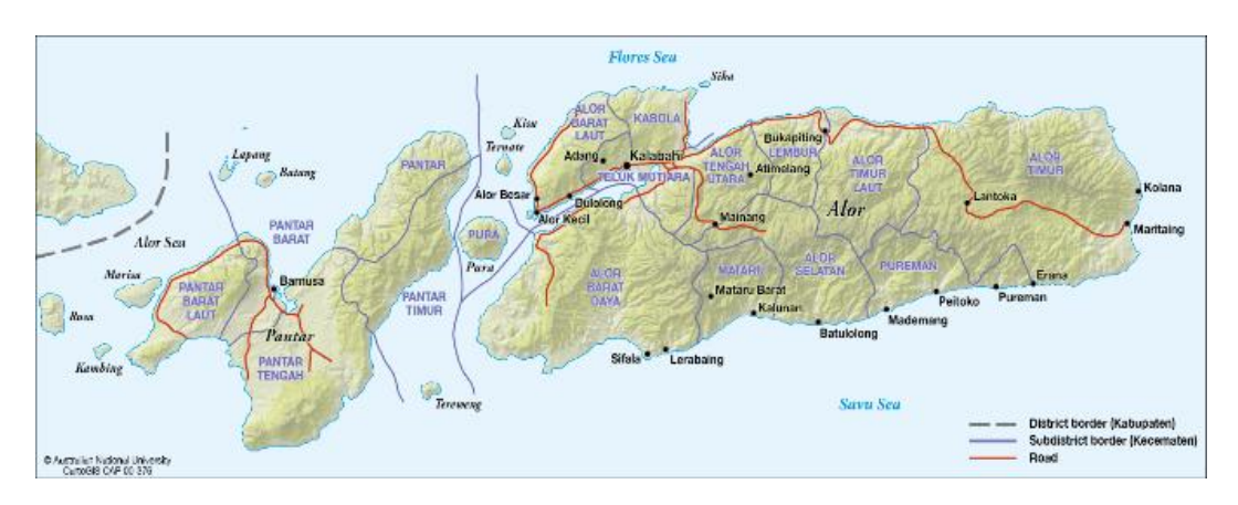
Figure 1. A map of Alor Island (ANU College of Asia & the Pacific, n.d.)

derived from plant names, including, for example, among others, the United States of America<sup>2</sup>, England<sup>3</sup>, Croatia<sup>4</sup>, Romania<sup>5</sup>, South Africa<sup>6</sup>, India<sup>7</sup>, China<sup>8</sup>, and Singapore<sup>9</sup>. Evidently, plants are highly intertwined with the landscape and place naming practices. This paper deals with the intersection of Abui Toponyms and Botany. As mentioned, plant names are reflected in toponyms worldwide. In the case of Abui, although a number of studies have been conducted on the Abui people and language, there is still a consistent research gap on how Abui horticultural and agricultural plants have influenced the making of place names in Alor Island (see Figure 1). Abui is a Papuan language spoken in Alor Island (Alor-Pantar Archipelago, South-East Indonesia, Timor area) by about 17,000 speakers<sup>10</sup>. Thus, this paper aims to ascertain the relationship between botanical lexicon and Abui Toponymy.