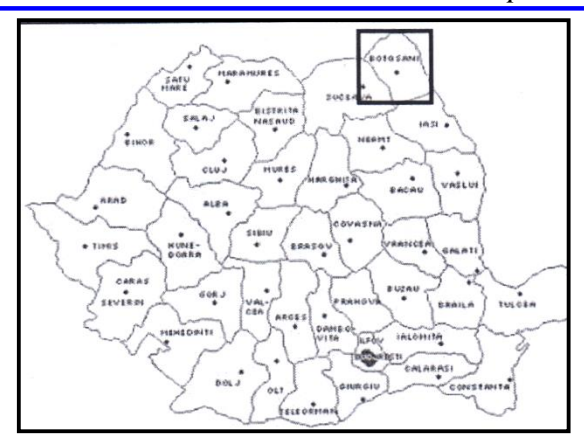
Figure 1. The geographical position of Botosani County in Romania