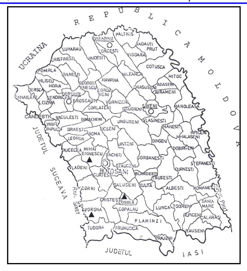
Figure 2. The locating rural villages studied